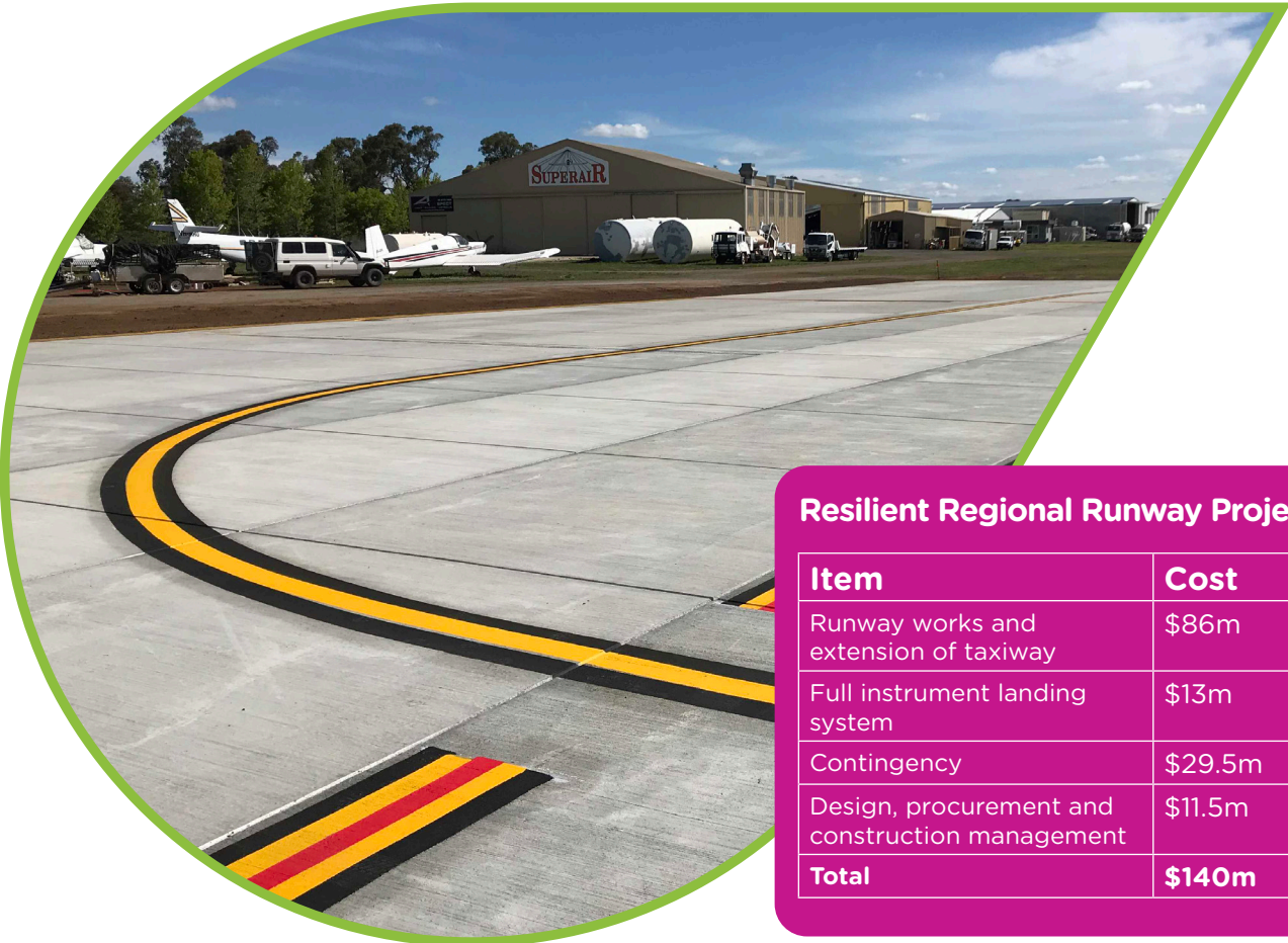
Resilient Regional Runway Project

Whilst Council is able to complete the design, tender and construction of the proposed runway and associated works within 24-30 months, Council requires a capital grant to deliver the runway. Council and users will be responsible for ongoing maintenance once the new runway is operational.